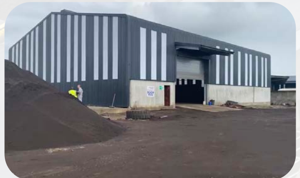
7-9 Street, IDZ 1 000, Alton