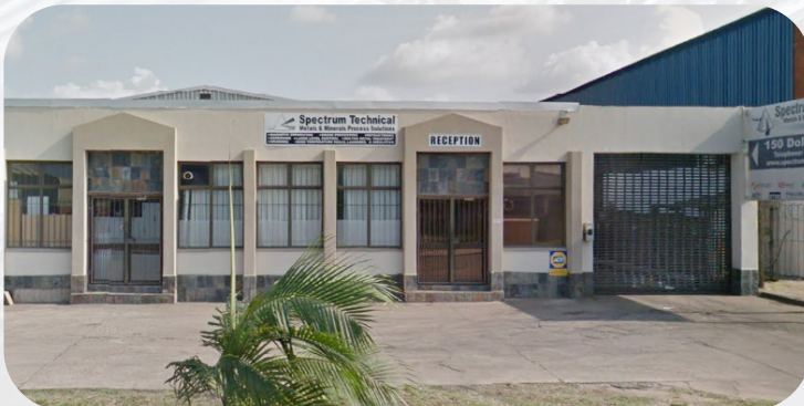
150 Dollar Drive, CBD, Richards Bay